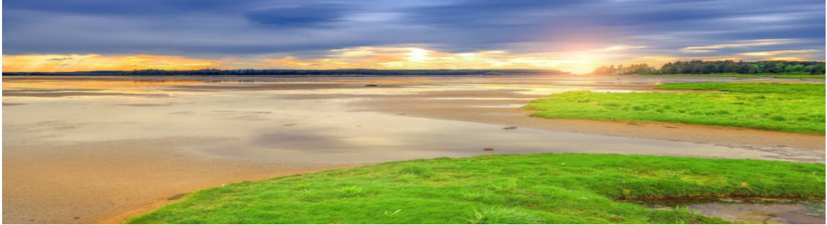
Findhorn Bay 5 minutes walk from the venue

Create transforming benefits in your well-being, health, and happiness 26 th -30 th August 2024 in Kinloss, Moray, Scotland