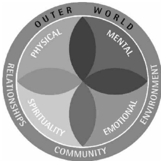
Dimensions of wellbeing

When we make a change in any one dimension, it will impact on the other dimensions, either enhancing or undermining overall wellbeing, as the examples below illustrate.